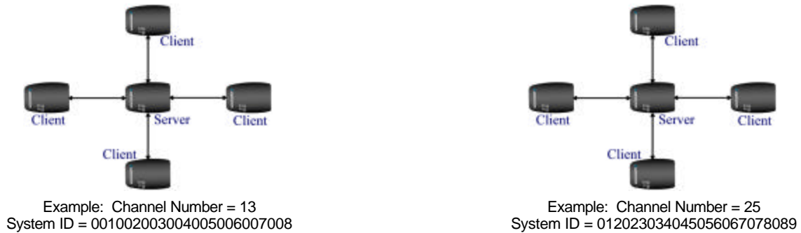
Figure 1 - Multiple Networks Of ConnexLink Units

The ConnexLink products provide a wireless RS232 connection between different devices. Each ConnexLink unit can be programmed as a Server or a Client, allowing for the creation of a two device or multiple device wireless network. In addition, multiple networks can be created by programming each network of ConnexLink units with unique Channel Number and System ID combinations. See Figure 1 below. To create a wireless network, simply program one of the units as a Server and the other units as Clients.