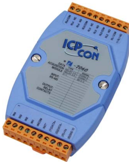
I-7060 Isolated Digital Input and Relay Module

The I-7060D adds 8 LEDs to the standard I-7060 as shown in the photo on the right. The I-7060D provides four isolated digital inputs and four relay outputs. The digital inputs have a wide range of voltage inputs. Logic 0 is 0 to +1 volt. Logic 1 is +3.5 to +30 volts. Digital input #4 can be used as a 16 bit counter with rates up to 100 kHz. The four sets of relay contacts are two SPST (Form A) contacts and two SPDT (Form C) contacts. Contact ratings are a rugged 2 A at 30 VDC and 0.5 A at 115 VAC. The I-7060D LEDs show which relays are energized.