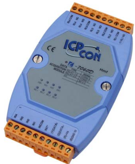
I-7060 Isolated Digital Input and Relay Module with Display LEDs