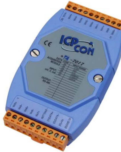
I-7017 Analog Module

The I-7000 series modules are controlled over an RS-485 network. RS-485 networks use differential signals and have a high degree of noise immunity due to the differential nature. Cable lengths can be up to 4,000 feet. The I-7000 communication protocol uses command packets with an address character and a checksum to validate the packet. All packets are acknowledged and erroneous packets are resent. The module address can be 01 to 255. All module configuration parameters such as address, baud rate etc. are saved in an internal EEPROM. D units have an optional 5 digit LED display.